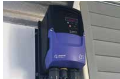
The Optidrive provides precise motor control and energy savings using the custom programs for each Commander fan.