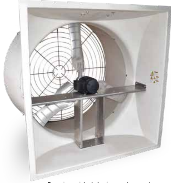
Corrosion resistant aluminum motor mounts, stainless steel hardware and props.