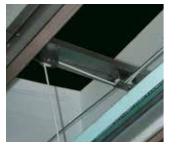
Actuated ceiling inlets include factory installed pulleys