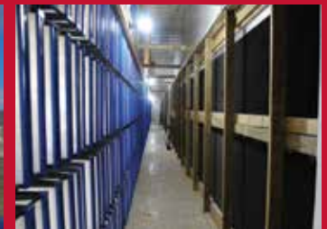
Positive Pressure Systems