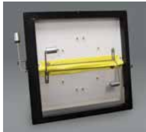
CAI-2700 CEILING INLET

All AP Inlets are pressure wash friendly for easy cleaning