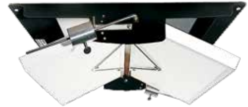
BI-FLOW CEILING INLET