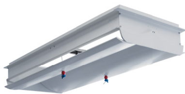
2-WAY ACTUATED CEILING INLET