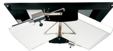
BI-FLOW CEILING INLET