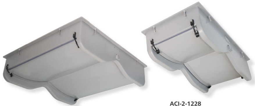
ACI-2-2828 28.5" x 28.5" Rough Opening