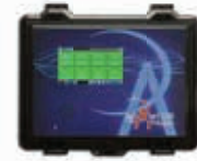
AA 128 TOUCH